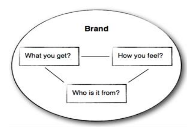
Figure 1: WYG-HYF-Wifmodel (J. Knowles, 2001)

A brand is defined as "a name, term, sign, symbol, or a combination of these that identifies the maker or seller of the product" (Kotler, Armstrong, Wong, & Saunders, 2008). In other words, a brand helps the consumers recognize the maker of a specific range of products, and enables the company to be differentiated from its competitors. This is the reason why the brand is considered as being an essential marketing tool.